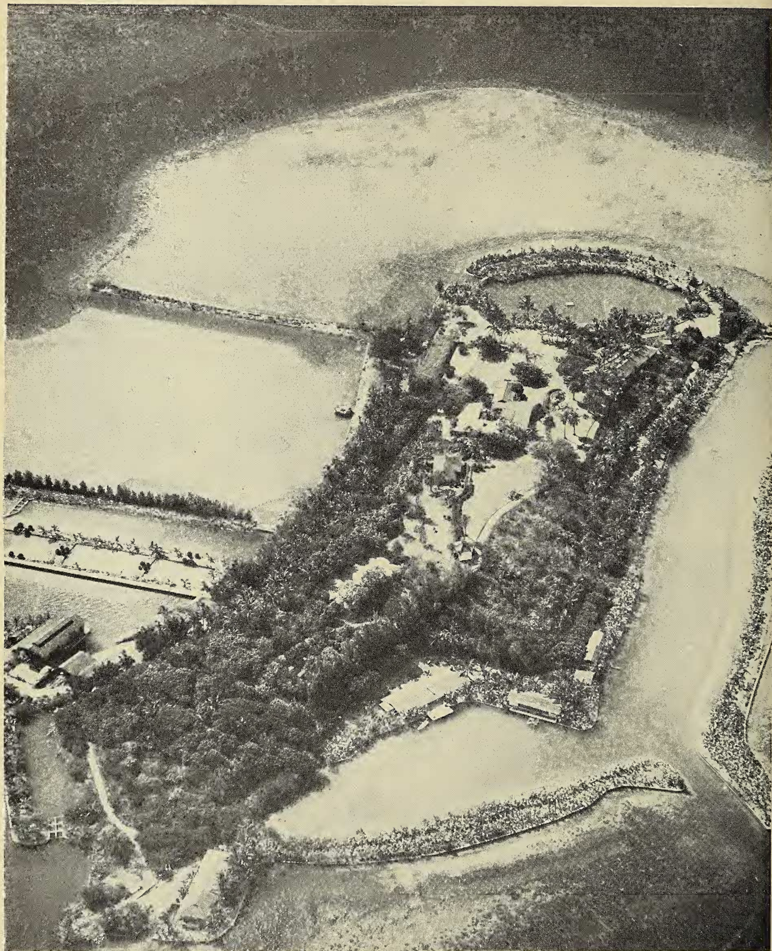
FIG. 1. Aerial view of Coconut Island, showing the Marine Laboratory (lower center) and the tidal pools (middle left).